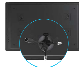
Multiple interface input